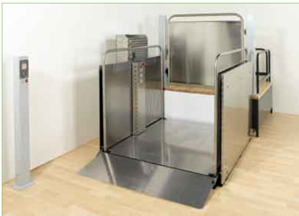
Version with the straight exit

Thanks to the electric lock, the gate is automatically opened when the platform reach the exit floor