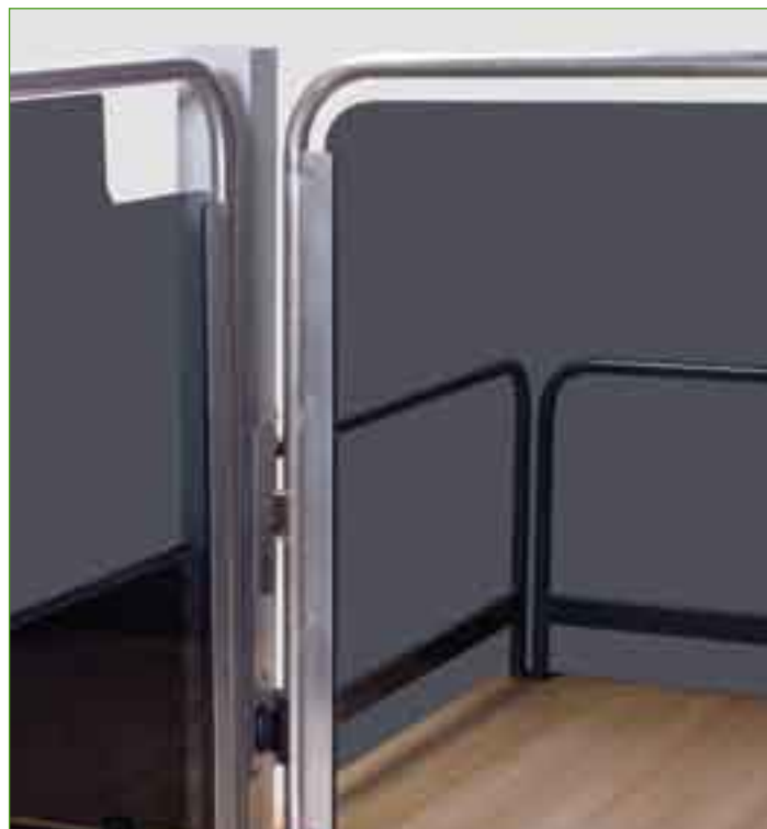
Version with the gate with crystal glass